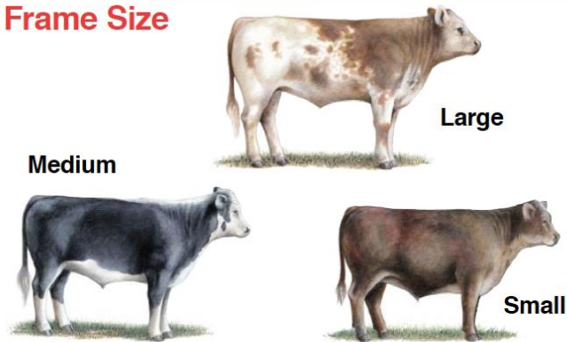
Large and medium frame pictures depict minimum grade requirements. The small frame picture represents an animal typical of the grade.