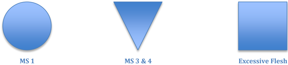
Figure 4: Jorgenson Muscling Theory

Muscle has a rounded shape when in abundance (Figure 4: MS 1). The Jorgenson’s Muscling Theory is a good way to help visualize the ideal muscling of a MS 1 or upper MS 2. Cattle receiving a MS 1 or upper MS 2 more optimally meet industry standards for yield grade. Yield grades are utilized to group carcasses according to the amount of boneless, closely trimmed retail cuts. Light muscled cattle have the appearance of an inverted triangle upon a rear view (Figure 4: MS 3 & 4). Cattle with less muscling in the hip and quarter will typically yield a smaller ribeye and deposit fat more quickly. This will drive the yield grade (YG) higher toward a YG 4 or 5 when fed to a similar fat thickness. Cattle with excessive flesh will appear to have a less rounded shape due to the fat deposits that develop in the upper hip and lower quarter.