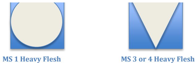
Figure 5: Jorgenson's Muscling Theory Excessive Flesh

Muscle has a rounded shape when in abundance (Figure 4: MS 1). The Jorgenson’s Muscling Theory is a good way to help visualize the ideal muscling of a MS 1 or upper MS 2. Cattle receiving a MS 1 or upper MS 2 more optimally meet industry standards for yield grade. Yield grades are utilized to group carcasses according to the amount of boneless, closely trimmed retail cuts. Light muscled cattle have the appearance of an inverted triangle upon a rear view (Figure 4: MS 3 & 4). Cattle with less muscling in the hip and quarter will typically yield a smaller ribeye and deposit fat more quickly. This will drive the yield grade (YG) higher toward a YG 4 or 5 when fed to a similar fat thickness. Cattle with excessive flesh will appear to have a less rounded shape due to the fat deposits that develop in the upper hip and lower quarter.