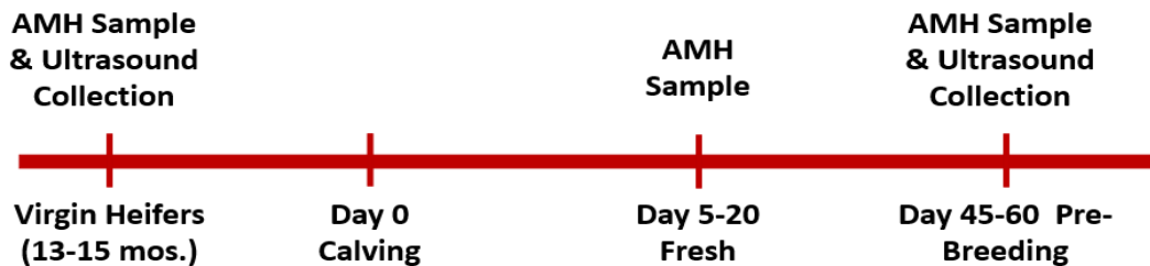
Figure 1: Timeline for data collection

The study followed 105 virgin Holstein heifers beginning when they were 12-15 months old. They were tracked with AMH sampled as pre-breeding heifers, again at freshening, and a final time at their first breeding in the lactating herd (Figure 1). In addition to AMH sampling, these animals were also traditionally evaluated through ultrasound of the reproductive tract with AFC, abnormalities, and cyclicity evaluated.